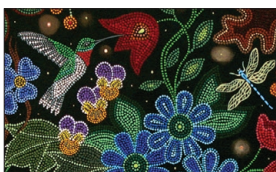
CREDIT: Artwork by Christi Belcourt used under license grant BEADWORK STYLE (detail) Acrylic on canvas © Christi Belcourt www.christibelcourt.com

In the home: Do not use (or reuse) materials in the home that contain asbestos (for example in insulation), arsenic (for example, in older pressure-treated wood) or creosote (for example, railway ties).